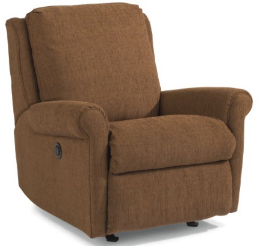
Optional power upgrade