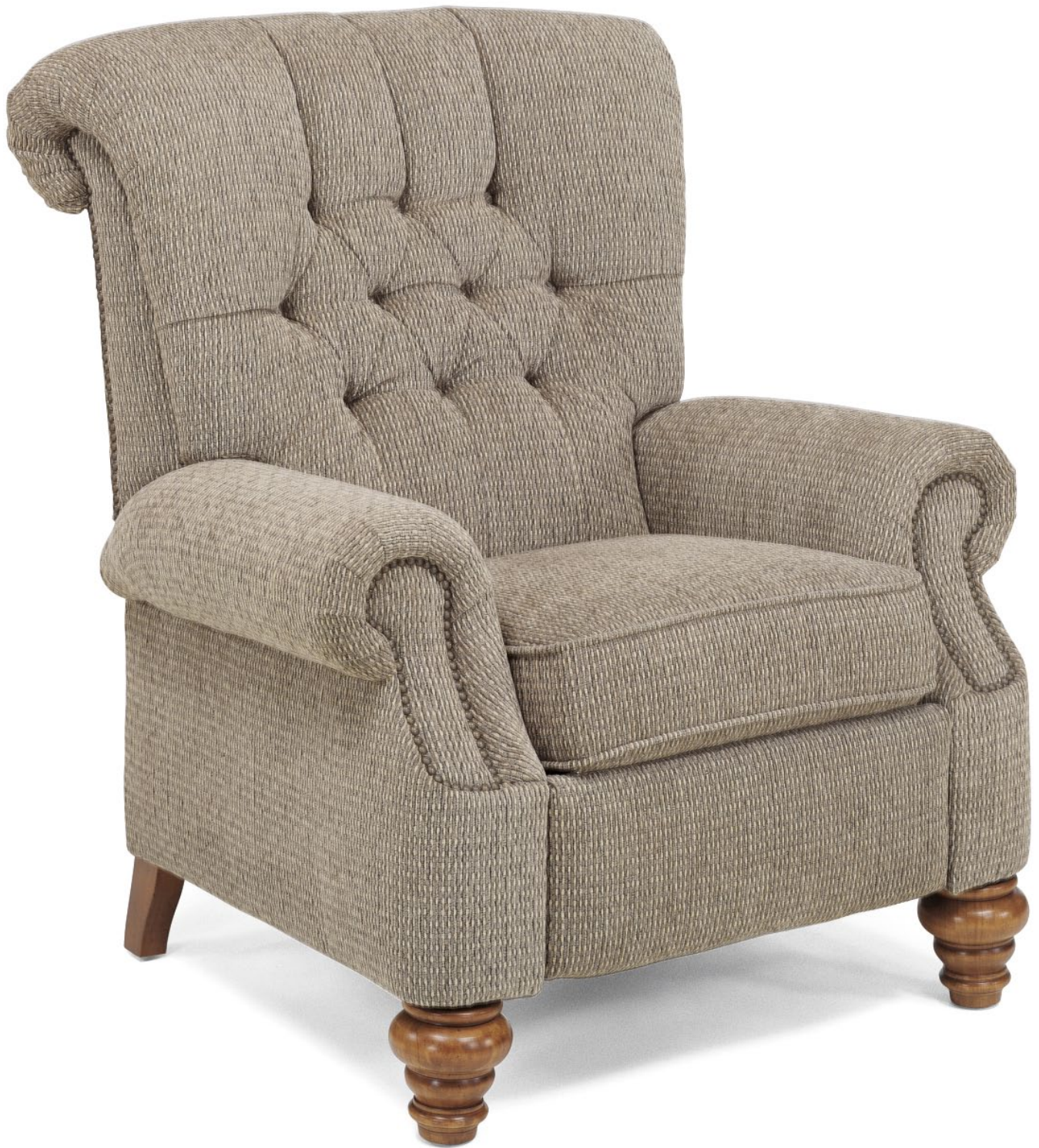
Equestrian 501R High-Leg Recliner