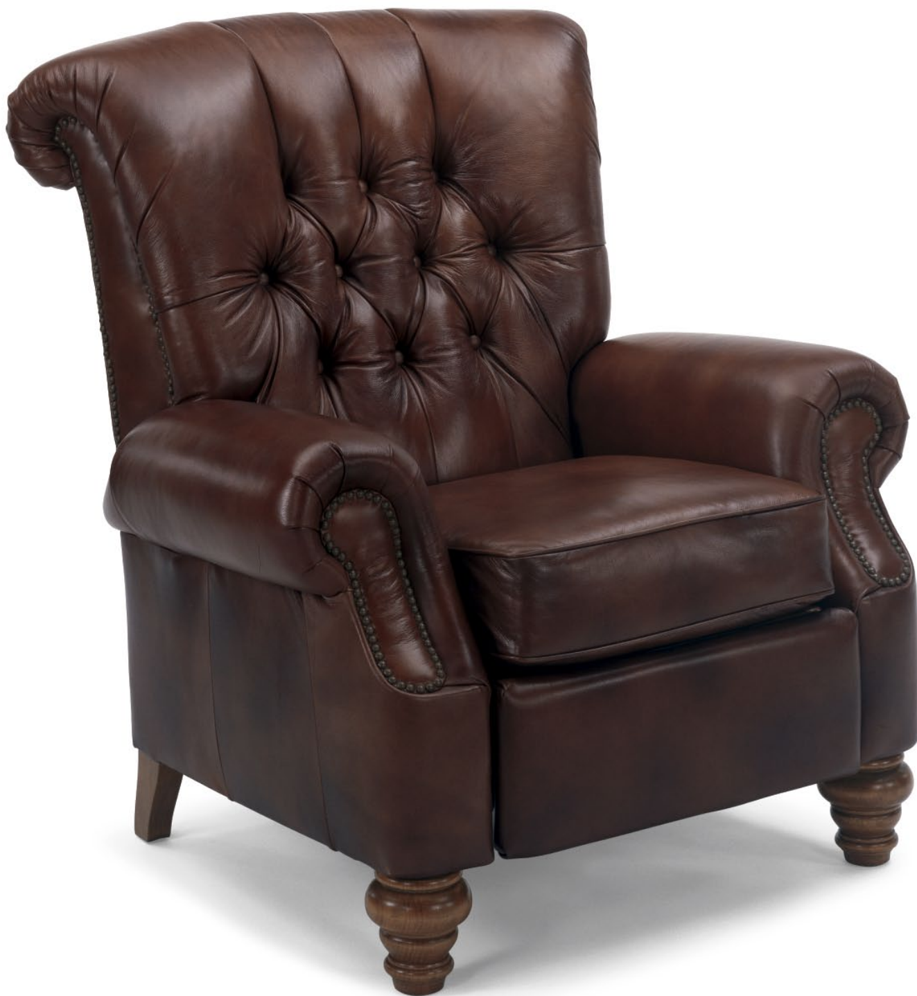
Equestrian 301R High-Leg Recliner