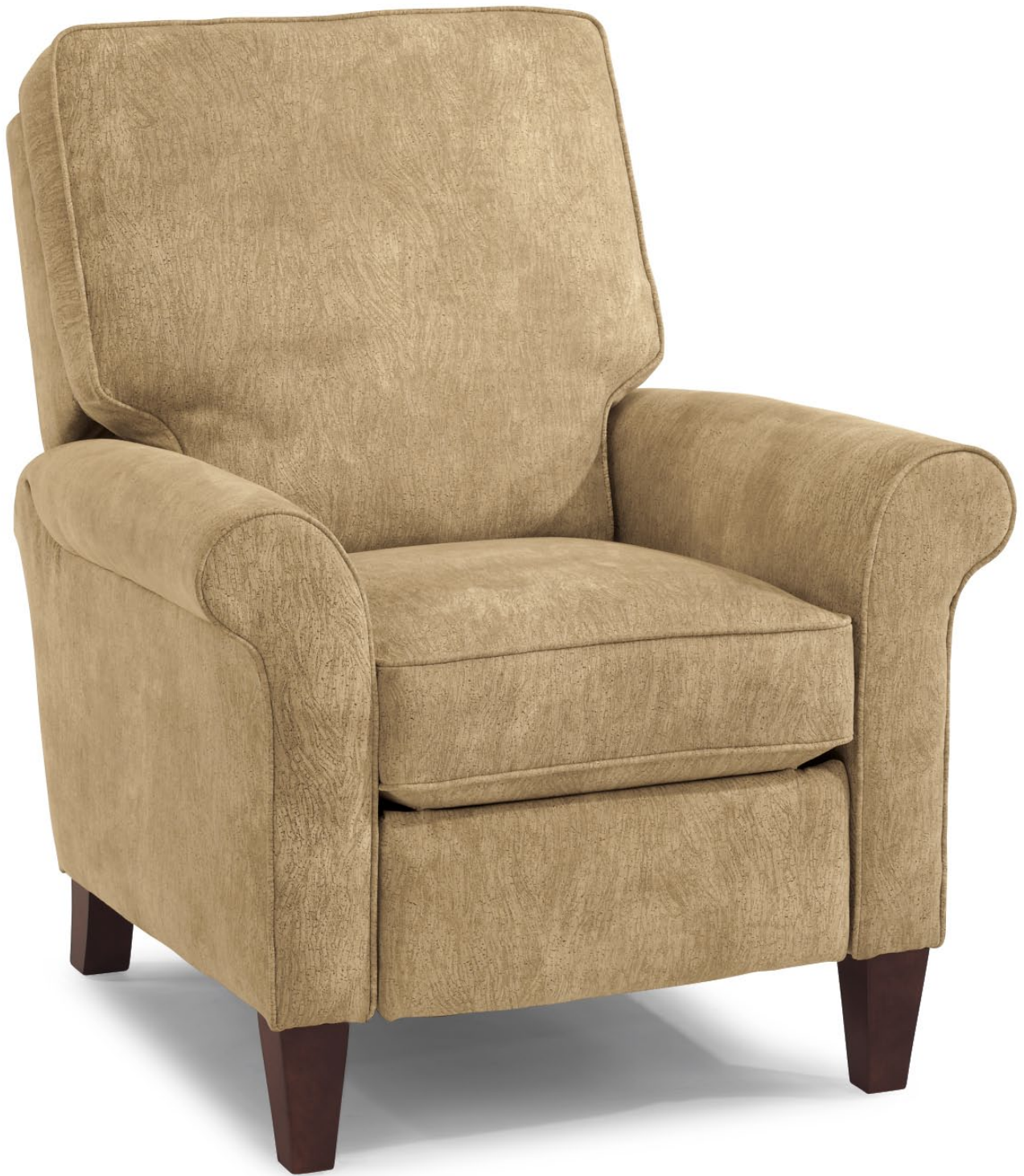
Westside 5979 High-Leg Recliner