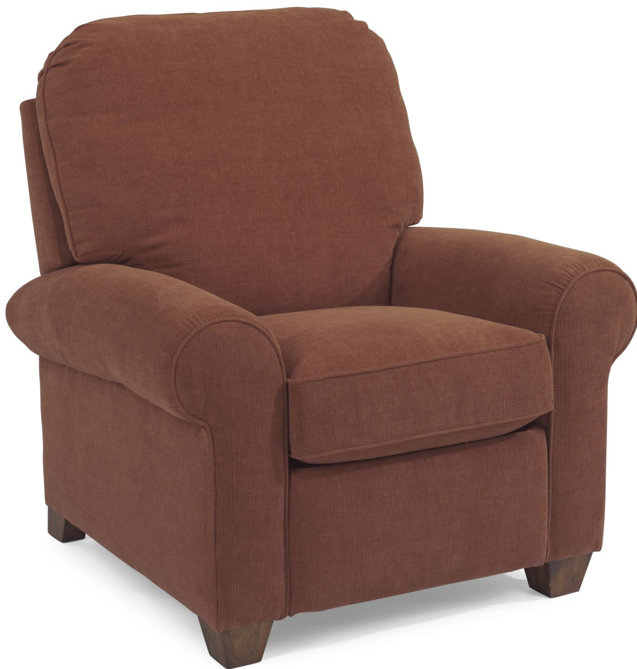
Thornton 5535 High-Leg Recliner