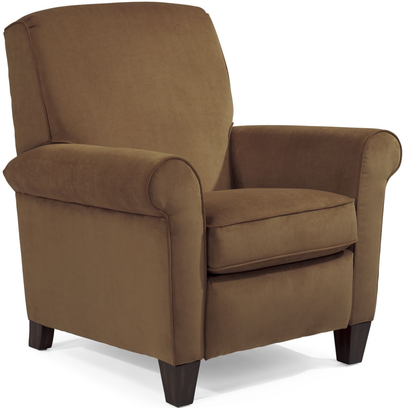
Dana 5990 High-Leg Recliner