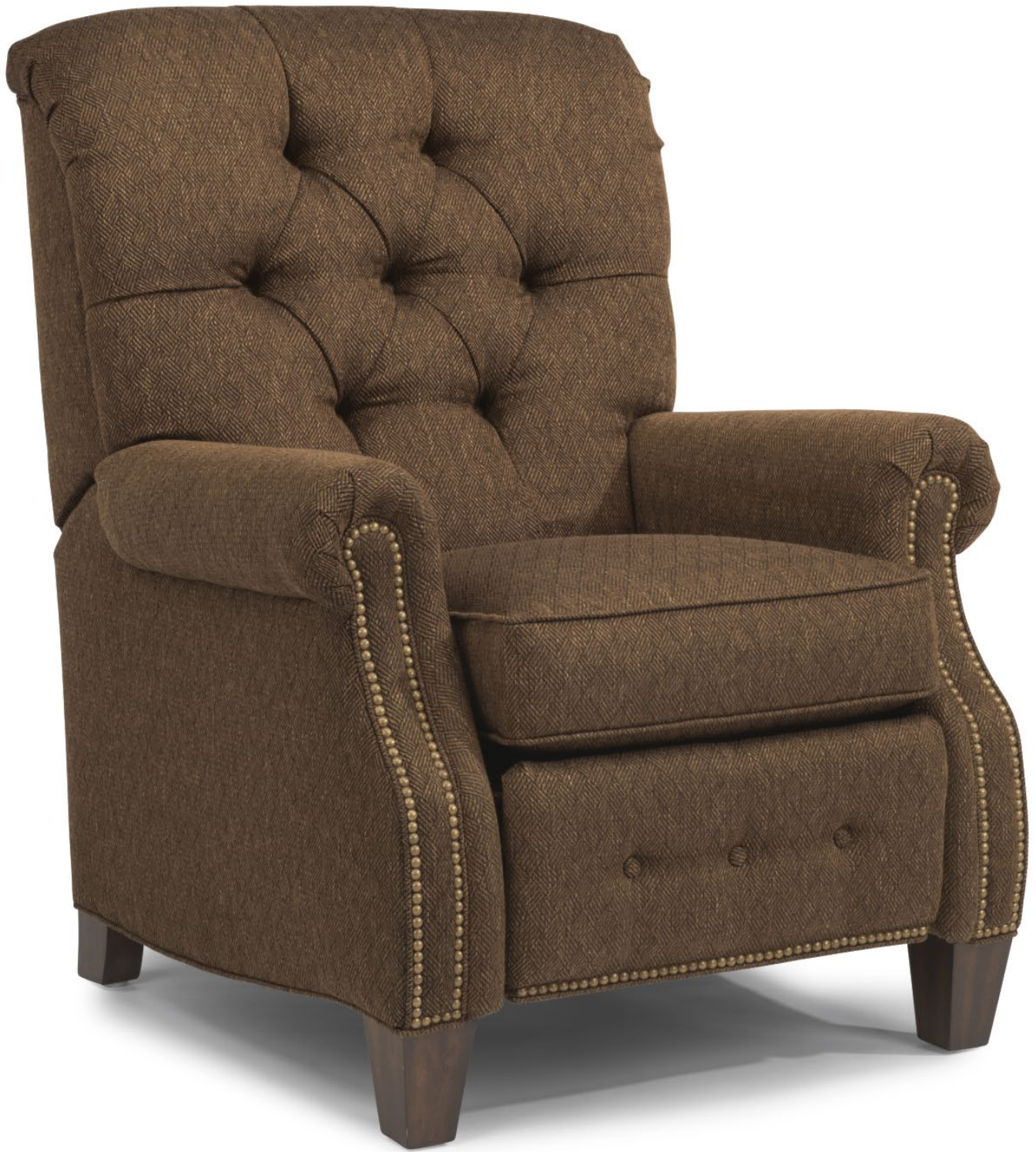
Champion 7386 High-Leg Recliner