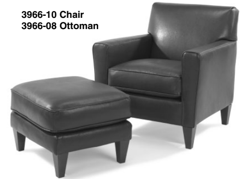
3966-10 Chair 3966-08 Ottoman