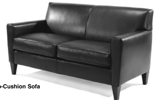
3966-30 Two-Cushion Sofa